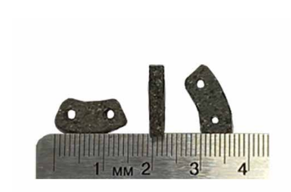
Traxxas slipper pads with size reference Qty 3 (one set)

Slipper pads are composite material pads that measure 14x6x2.5mm and weigh approximately 1 gram per set of 3. Nitro model brake pads are similar. The friction pads are non-friable (i.e., do not easily crumble, break apart, or release dust or fibers), generate minimal dust from wear, and for all electric models are enclosed within a cover on the transmission assembly. See below for examples.